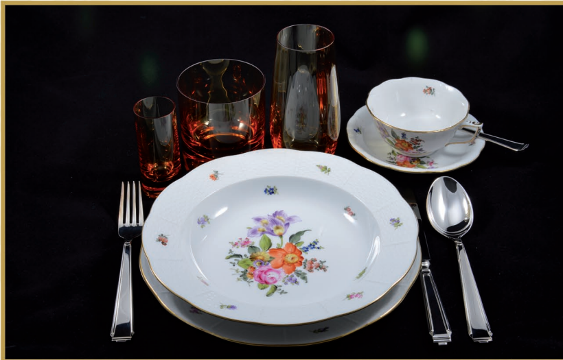
DE HEREND ART DECO LADY HAMILTON 1934

One of the most famous drinking sets of the Moser glassworks. Splendid is often represented as the "chef d'oeuvre" of the Moser collections. The surface of this masterpiece of design and craftsmanship is adorned with a sparkling cross-cut filigree complemented by a wide gilded border with palmettes and acanthus scrolls. Lower part of the bowl is decorated with a band of vertical wedge cuts, middle part with diamond cut and a band of olives.