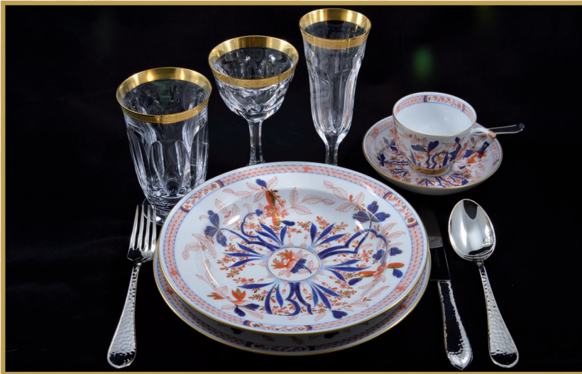
CANTON, MARTELE, LADY HAMILTON

These fully formed goblets are hand cut into six typically broad, curved-ended facets. Simply elegant and balanced, one of the most popular collections with the Moser brand. The beauty of the set can be enhanced by gold or platinum décor or a thin gilded line bordering the edge of the glass.