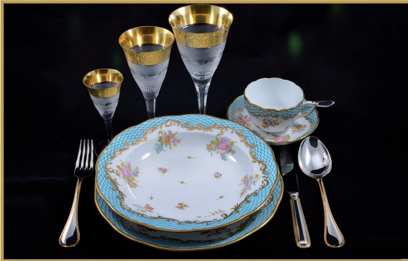
CARREAUX BLEUS TURQUOISES, FRANZOSISCH PERL WITH GOLD, SPLENDID 1911

Herend Porcelain: "Carreaux Bleus Turquoises" (Dinner plate, soup plate, cup and saucer)