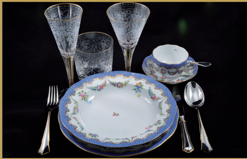
GUIRLANDE DE LIECHTENSTEIN, ALT-CHIPPENDALE WITH GOLD, MAHARANI-1895

Moser Crystal Glass: "Lady Hamilton" collection These fully formed goblets are hand cut into six typically broad, curved-ended facets. Simply elegant and balanced, one of the most popular collections with the Moser brand. The beauty of the set can be enhanced by gold or platinum décor or a thin gilded line bordering the edge of the glass.