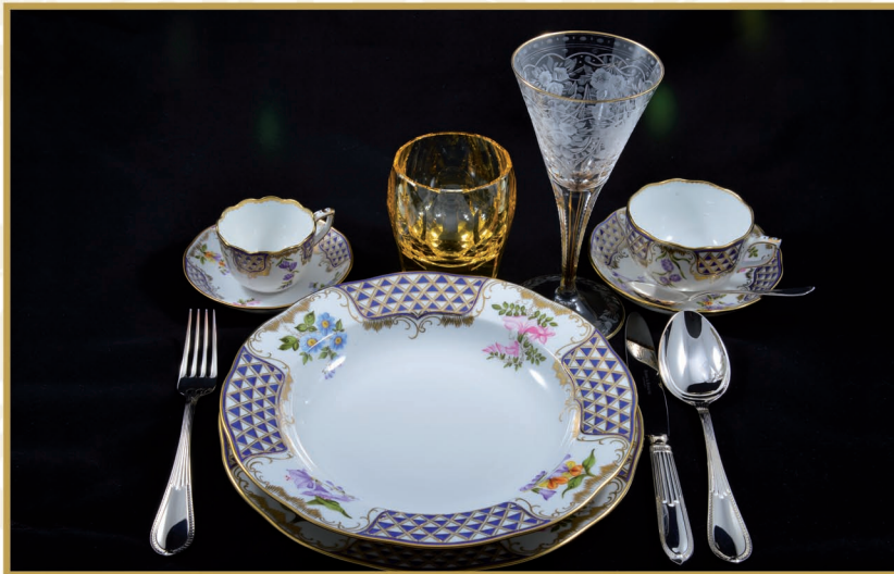
MOSAÏQUES TRIANGULAIRES ET FLEURS DE CHAMPS, BELVEDERE, MAHARANI 1895

(Dinner plate, soup plate, cup and saucer)