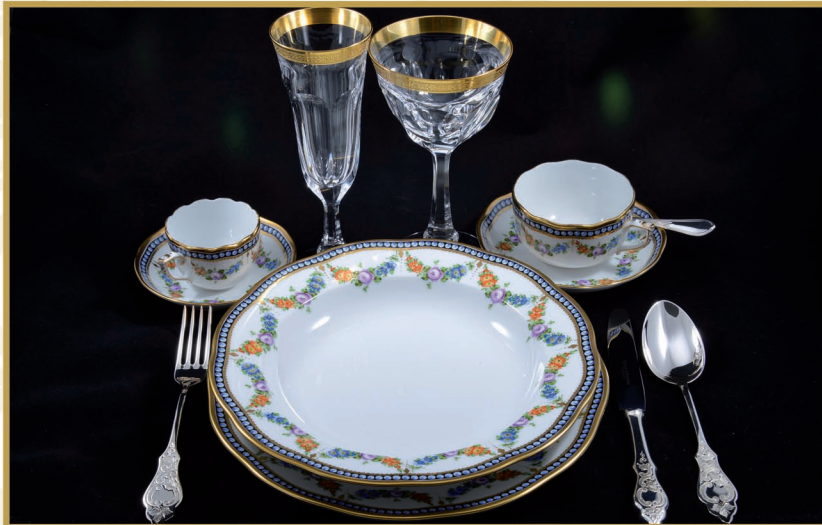
GUIRLANDE DE FLEURS BLEUES ET POURPRES, OSTFRIESEN, LADY HAMILTON

Drinking set Maharani gained its popularity and name after it was commissioned for the wife of Maharajah of Navancore. The flute-shaped goblet is delicately engraved with a symphony of cascading flora. The cut stem is pearled and gilded on its edges. A golden rim completes this masterpiece of the glassmaker's art.