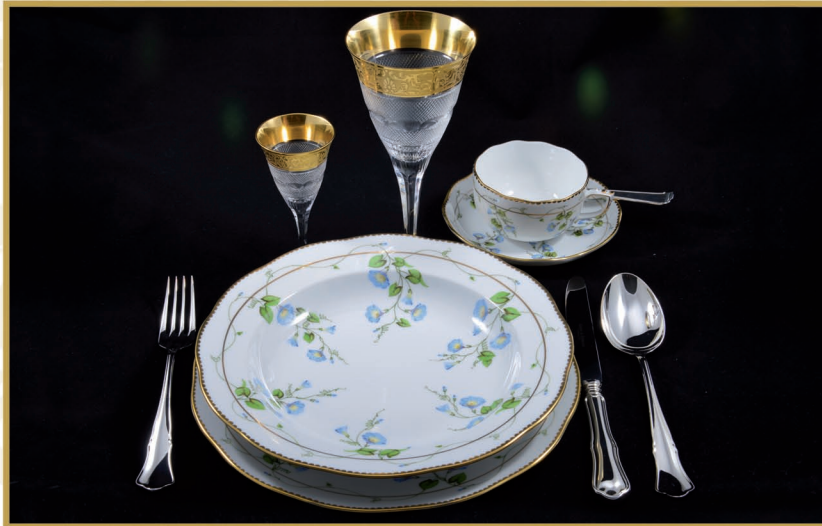
NYON, ALT CHIPPENDALE WITH GOLD, SPLENDID 1911

Herend Porcelain: "Nyon" (Dinner plate, soup plate, cup and saucer) The snow-white ground of the pattern is surrounded by a gilded line of scales. Inside that is a line of gold twined with supple morning glories. The beautiful flower cups of blue petals with pale yellow centres grow inwards towards the centre of the pattern, accompanied by green leaves with dark contours, their tendrils lending the design verve.