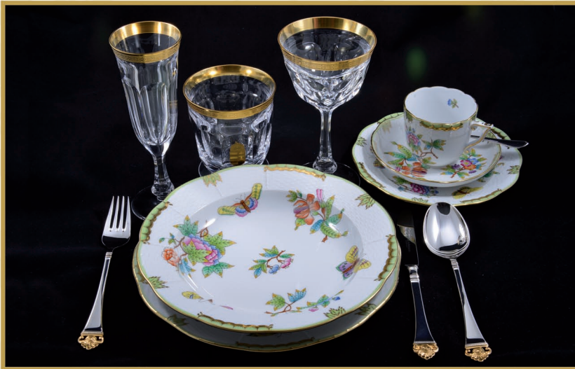
VICTORIA, ROSENMUSTER WITH GOLD, LADY HAMILTON 1934

One of the most famous drinking sets of the Moser glassworks. Splendid is often represented as the "chef d'oeuvre" of the Moser collections. The surface of this masterpiece of design and craftsmanship is adorned with a sparkling cross-cut filigree complemented by a wide gilded border with palmettes and acanthus scrolls. Lower part of the bowl is decorated with a band of vertical wedge cuts, middle part with diamond cut and a band of olives.