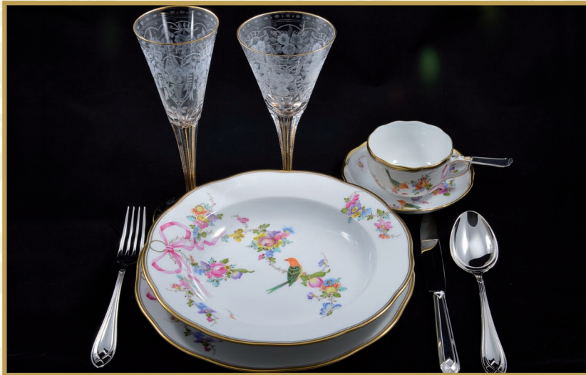
JARDIN MEDITERRANEEN, ARCADE, MAHARANI 1895

Moser Crystal Glass: "Splendid" collection One of the most famous drinking sets of the Moser glassworks. Splendid is often represented as the "chef d'oeuvre" of the Moser collections. The surface of this masterpiece of design and craftsmanship is adorned with a sparkling cross-cut filigree complemented by a wide gilded border with palmettes and acanthus scrolls. Lower part of the bowl is decorated with a band of vertical wedge cuts, middle part with diamond cut and a band of olives.