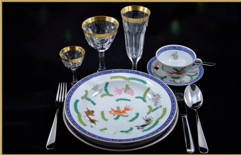
POISSONS, DANTE, LADY HAMILTON 1934

Herend Porcelain: "Poissons" (Dinner plate, soup plate, cup and saucer)