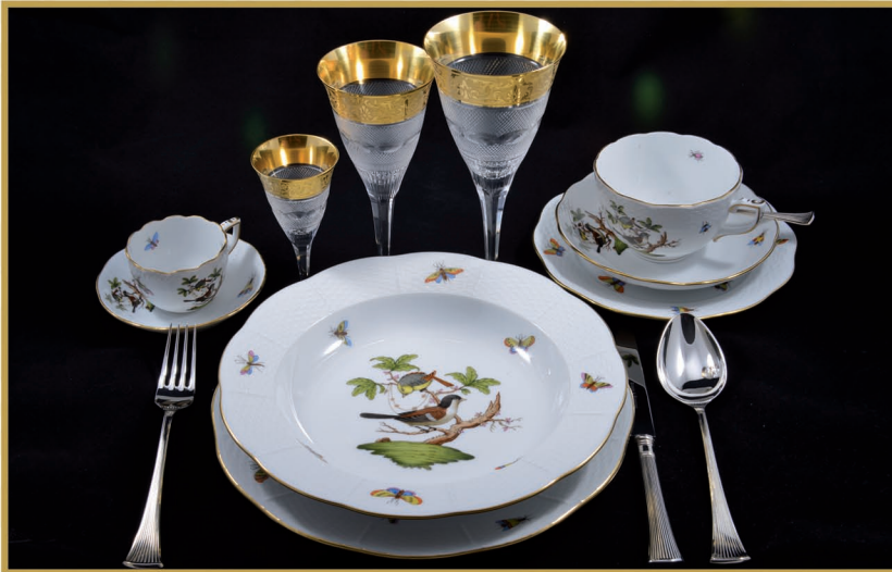
ROTHSCHILD, AVENUE, SPLENDID 1911

Herend Porcelain: "Rothschild" (Dinner plate, soup plate, cup and saucer)