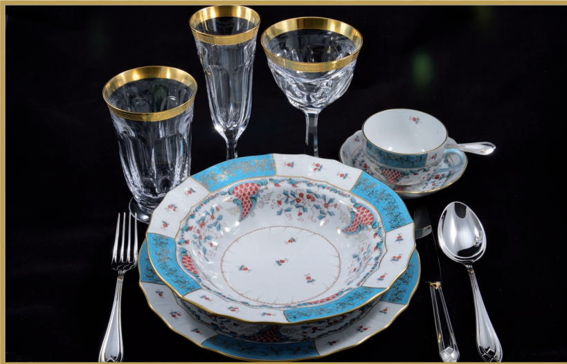
TUPINI, CORNE D'ABONDANCE, ARCADE WITH GOLD, LADY HAMILTON 1934

Herend Porcelain: "Tupini, Corned'Abundance" (Dinner plate, soup plate, cup and saucer) Motifs from the mysterious Orient, the master of Herend have conjured up the heated, spicy, intoxicating fairy world of the Arabian Nights.